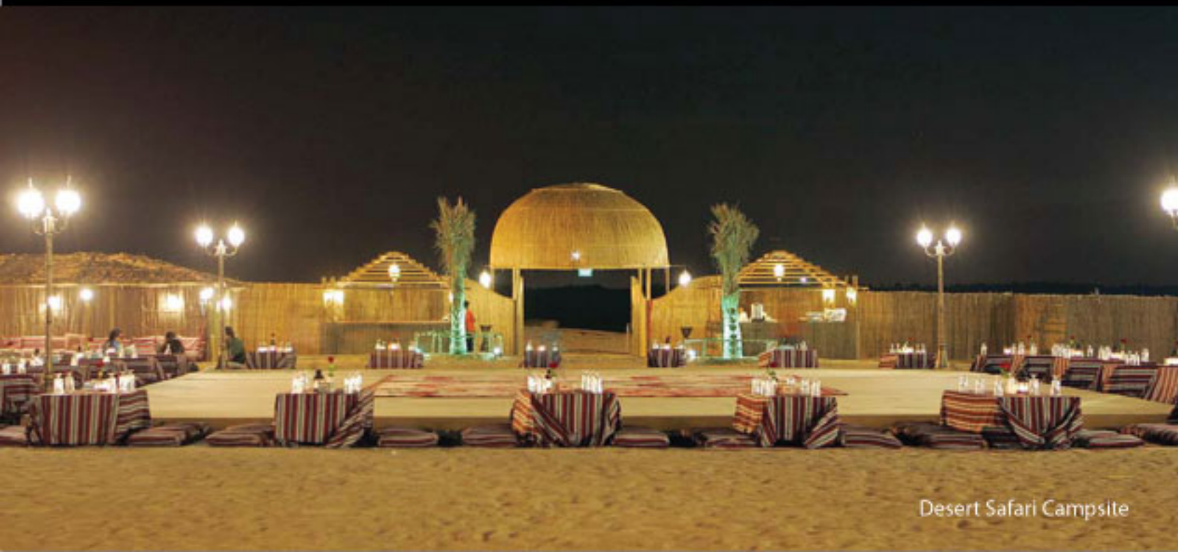
Desert Safari Campsite